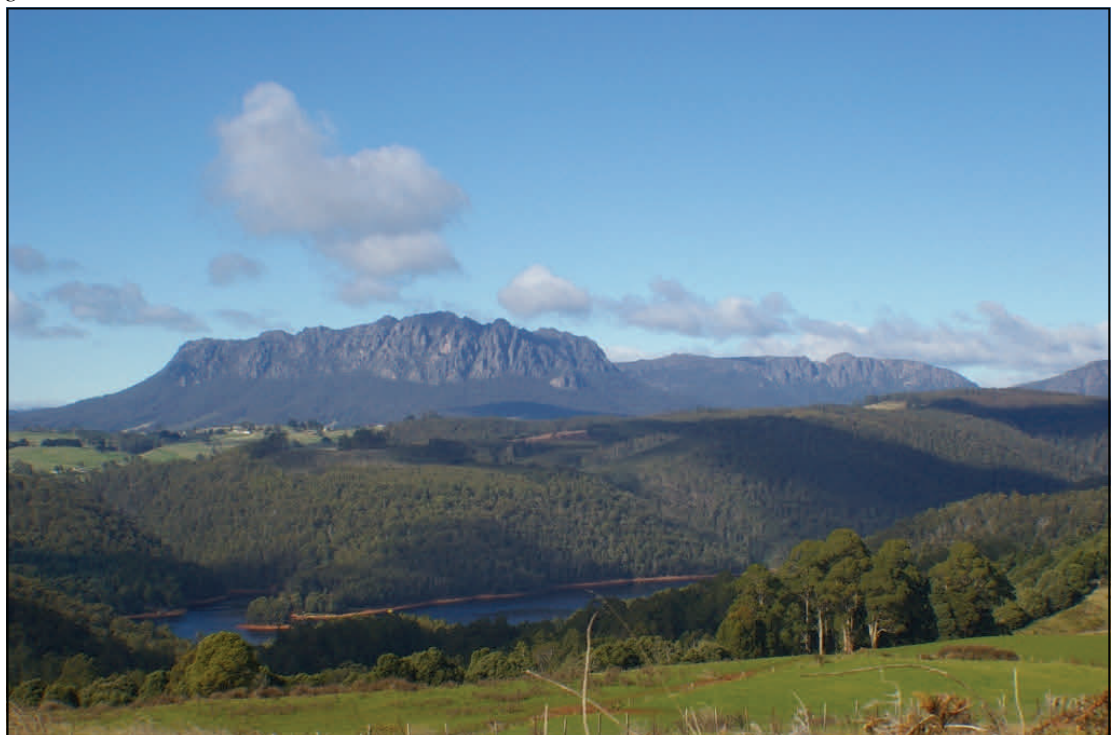
Cradle Mountain road, overlooking Lake Cethana

Where do you keep your fingers in a cuddle?