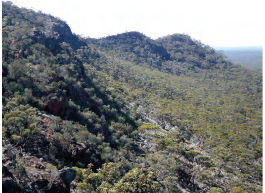
Photo above: Viewing the Great Western Woodlands Photo at right: Part of the Helena Aurora Range

The Helena Aurora Range is found in the Great Western Woodlands east of Mukinbudin and north of Southern Cross and Koolyanobbing. Its length is 13kms of convoluted banded ironstone formation (BIF) and the largest range in the central Yilgarn with the highest species conservation and landform values. It is Kalamai Kapurn people's country, a people who hold the emu as an important totem; their range is called Bungalbin.