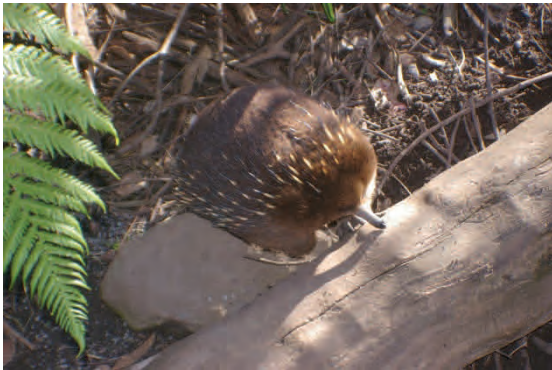
Left: Tasmanian echidna (hairy for warmth). Right: Common Wombat