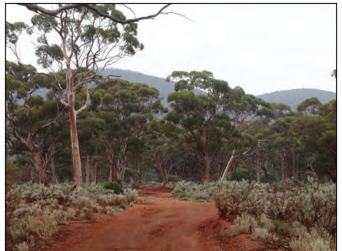
Above: The Great Western Woodlands and Bungalbin