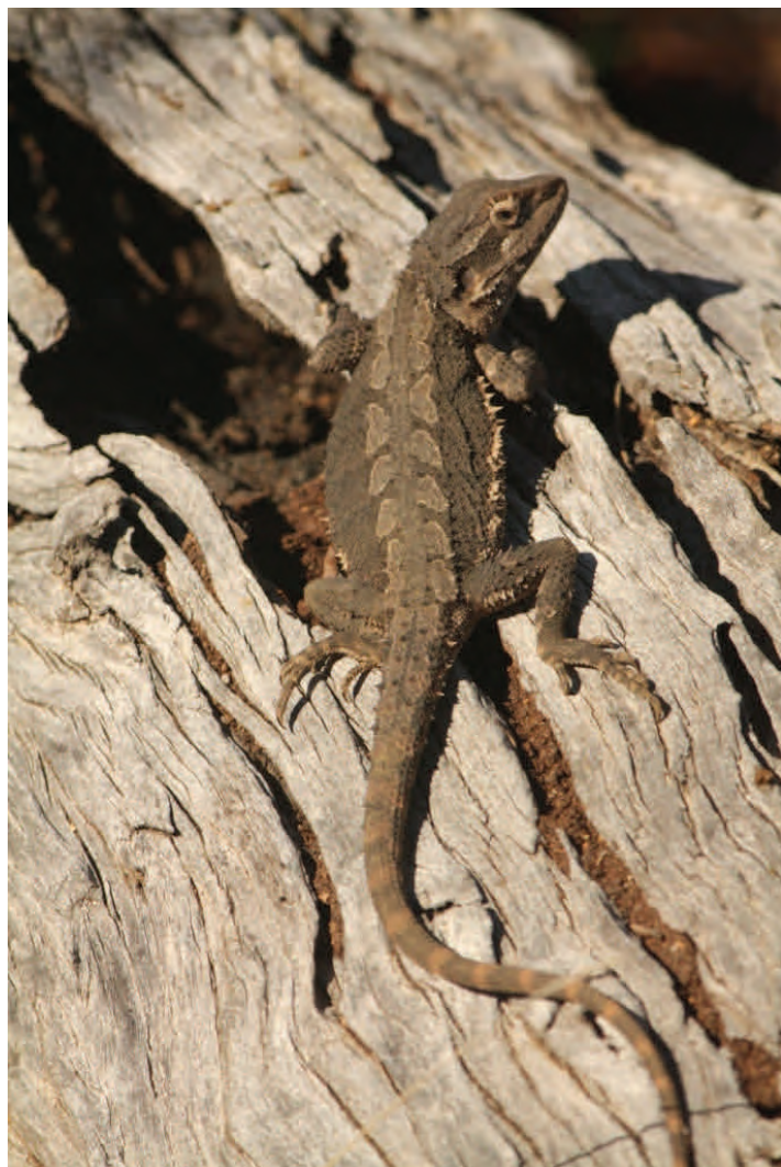
Photographs, clockwise from above: Bracket fungi ; Western bearded dragon ; Kunapalari frog ( Neobatrachus kunapalari) ; Toodyay sunset with four swans in flight